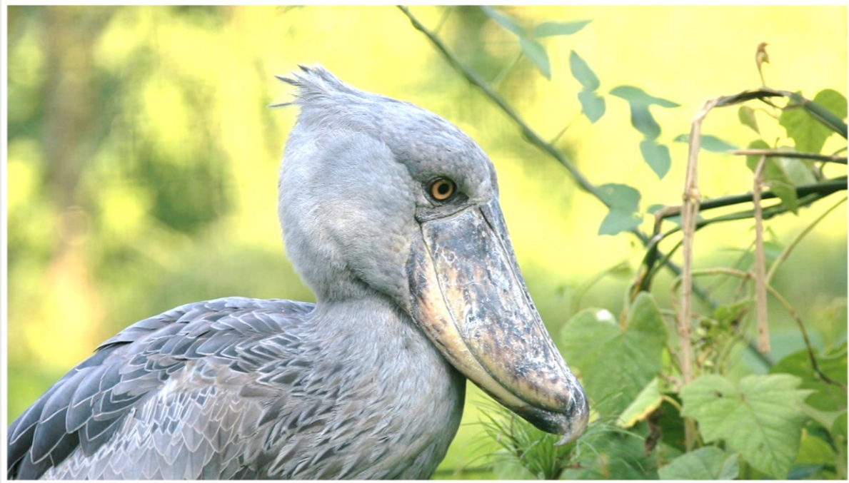
Shoebill – Murchison Falls National Park