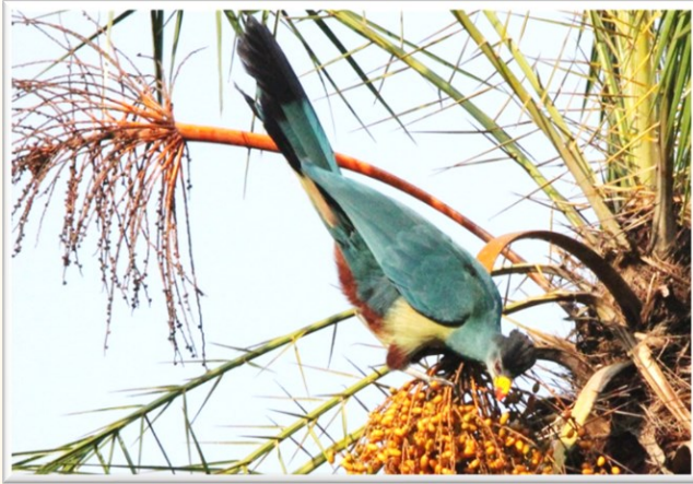
Great Blue Turaco

Day 3; Whole day Birding the famous Royal Mile and return in the evening in time for the night jars and owls. This will overnight us in any hotel of any choice. For the Ituri Specials that only occurs at this corner in the entire East-Africa region.