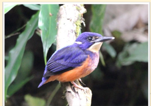
Buhoma Bwindi Ranger Africa Safaris

Day 11; Game drive and transfer to Buhoma thus birding on the way, birding the home of the tree climbing lions increases the chances of them up in the figs of the Ishasha sector of Queen Elizabeth national park. Tree climbing Lions are the highlight of this area. Overnight in Buhoma.