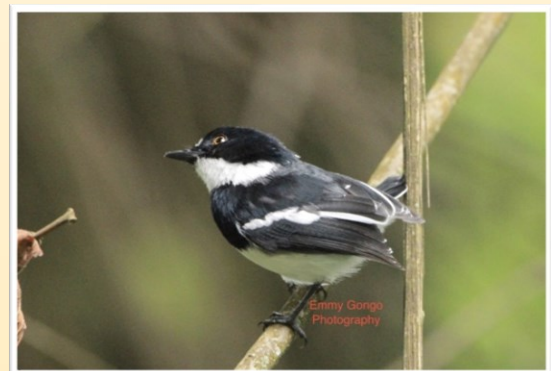
Volcanoe Gorge walk Rwenzori Batis

Day 16; Road Transfer to Kisoro and on the way birding at Lake Bunyonyi for swamp endemics such as the Papyrus swamp warbler, White-winged warbler, the Victoria masked weaver (a race that is still under research to be re-Included after getting recorded as extinct. Later head on to Kisoro as we are birding the environment. Overnight at Kisoro.